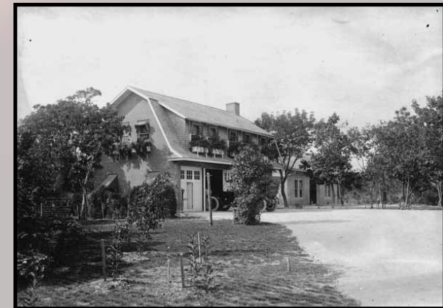
Carriage House & Power House, 1916.

Today, the Carriage House and Power House make up the Artist Village, providing studio, exhibit and classroom space for local writers, poets, painters, sculptors and other artists who come to the Deering Estate through its prestigious Artist in Residence Program.