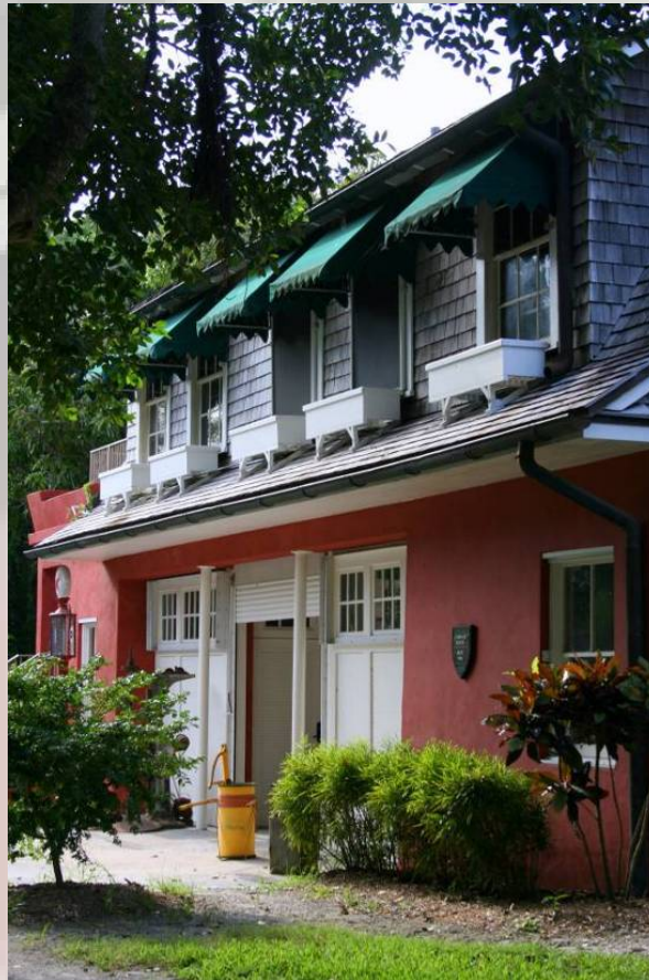
DEERING ESTATE AT CUTLER